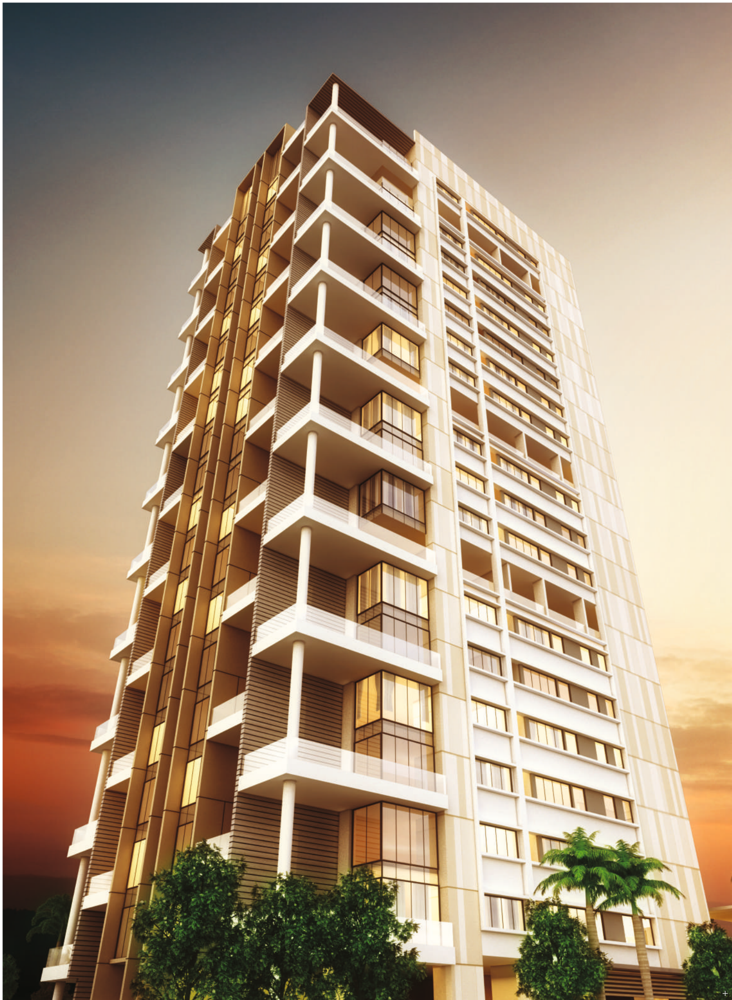
+Artists impression of the architectural visualization