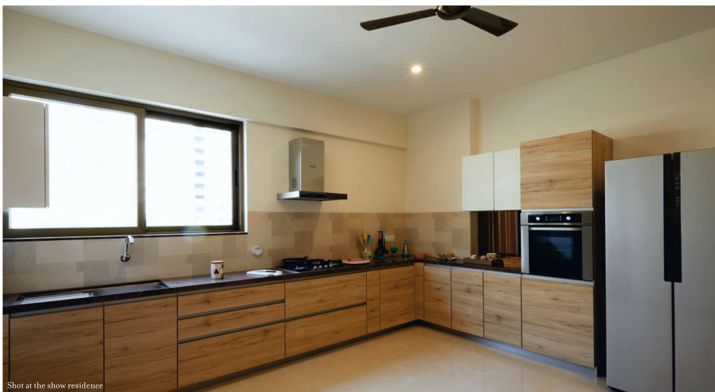
Shot at the show residence