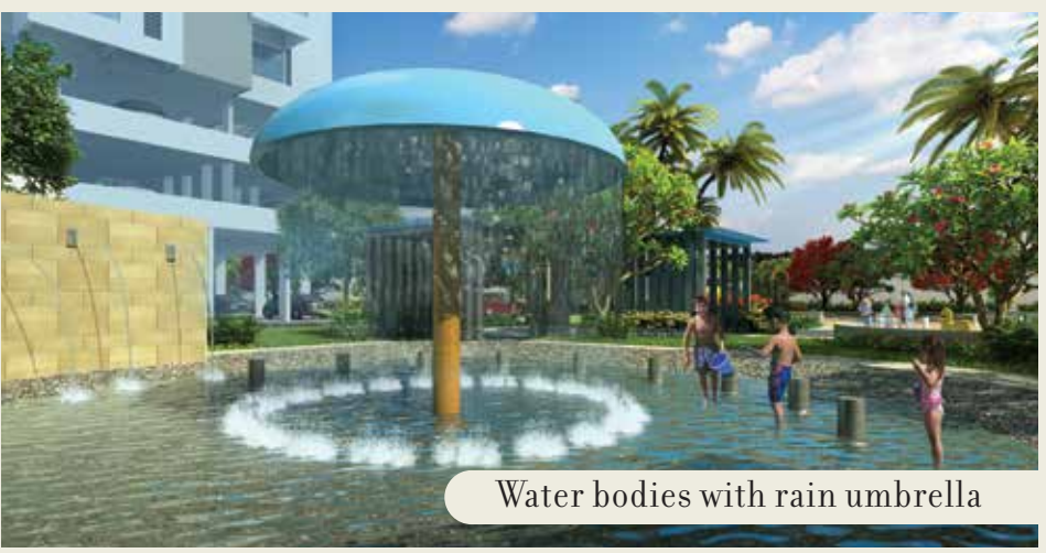
Water bodies with rain umbrella