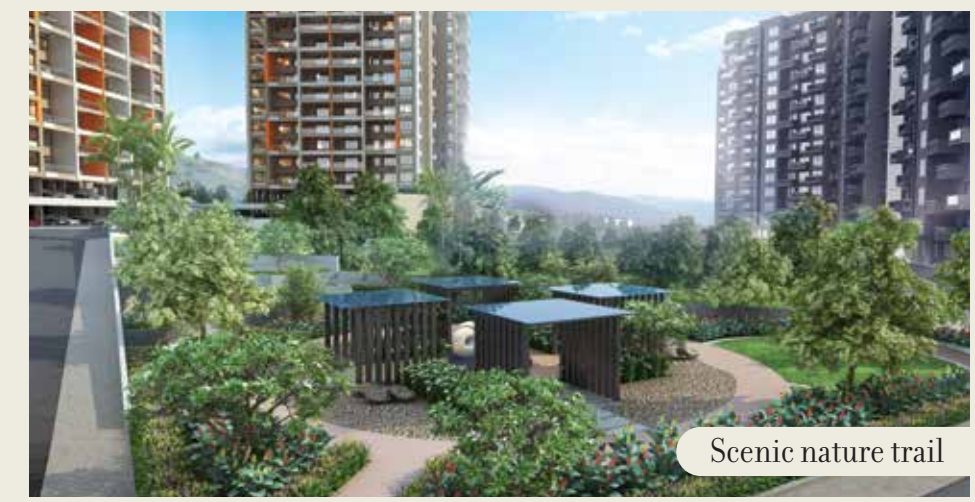
Scenic nature trail