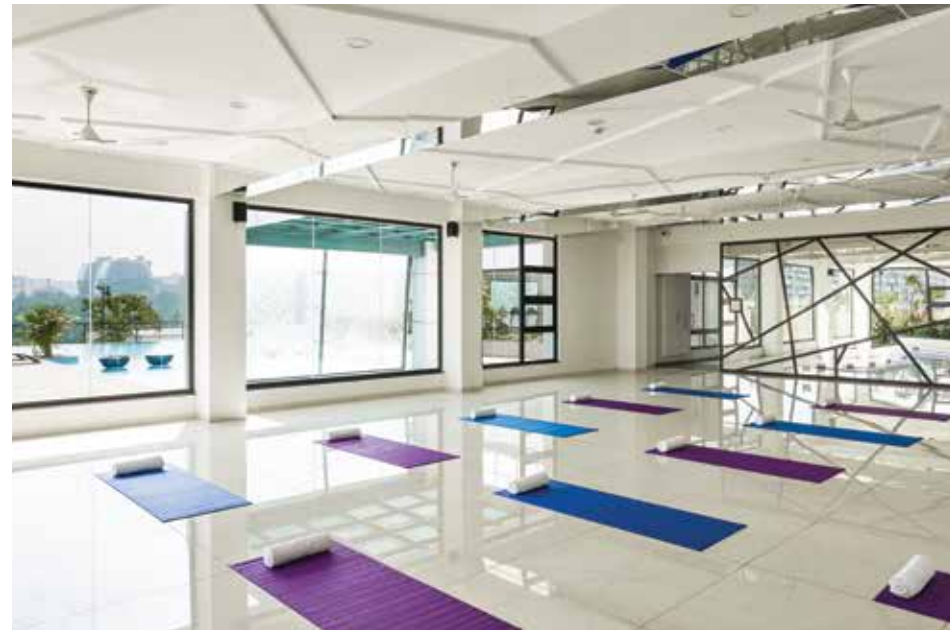
Meditative Yoga Deck to reflect on your day.