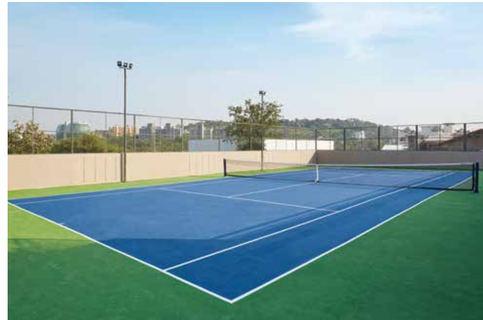
Smash your aces at the Tennis Court.