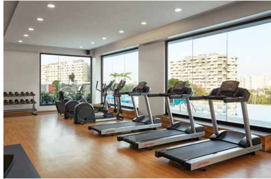
Burn some calories at our well-equipped Gym.