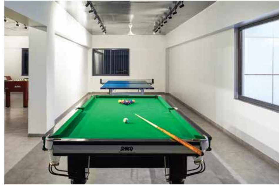
Hang out with pals at the Pool Table.