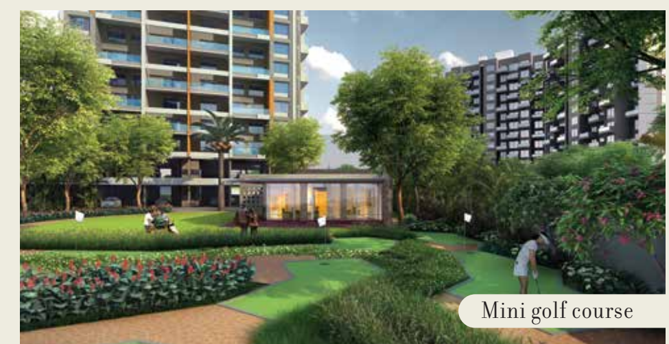
Mini golf course