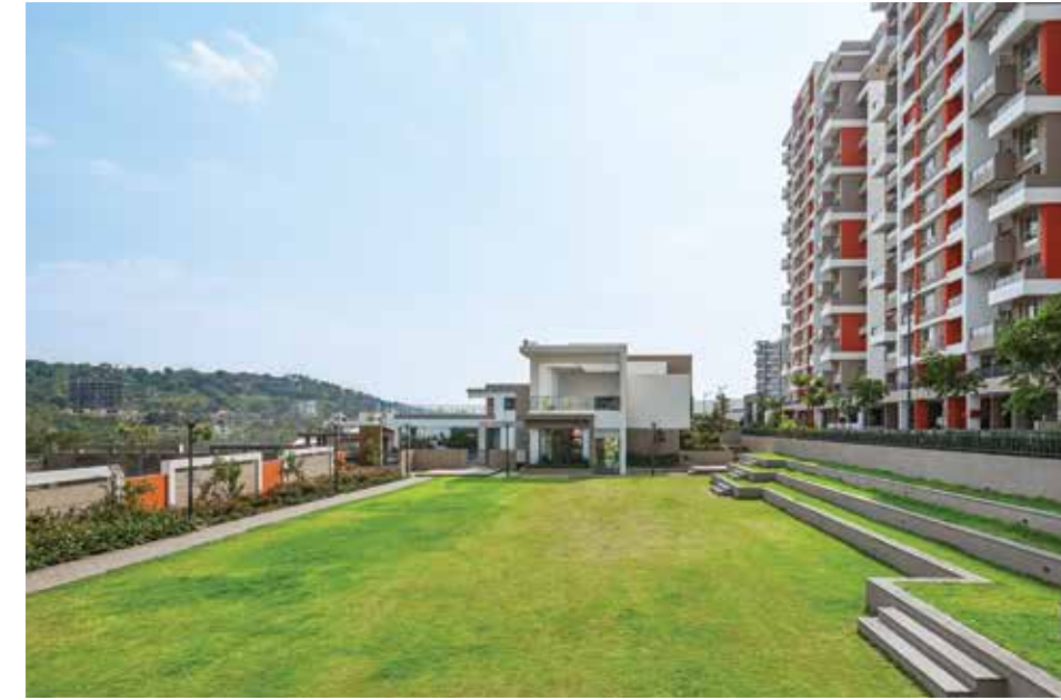
Spend some quiet family time at the open Family Lawn.