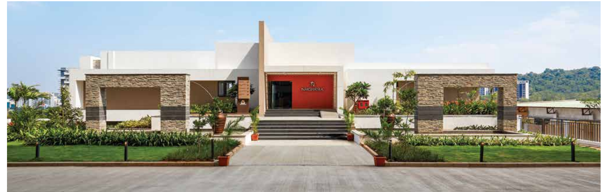
Lose yourself every day, at Nakshatra - The Club.