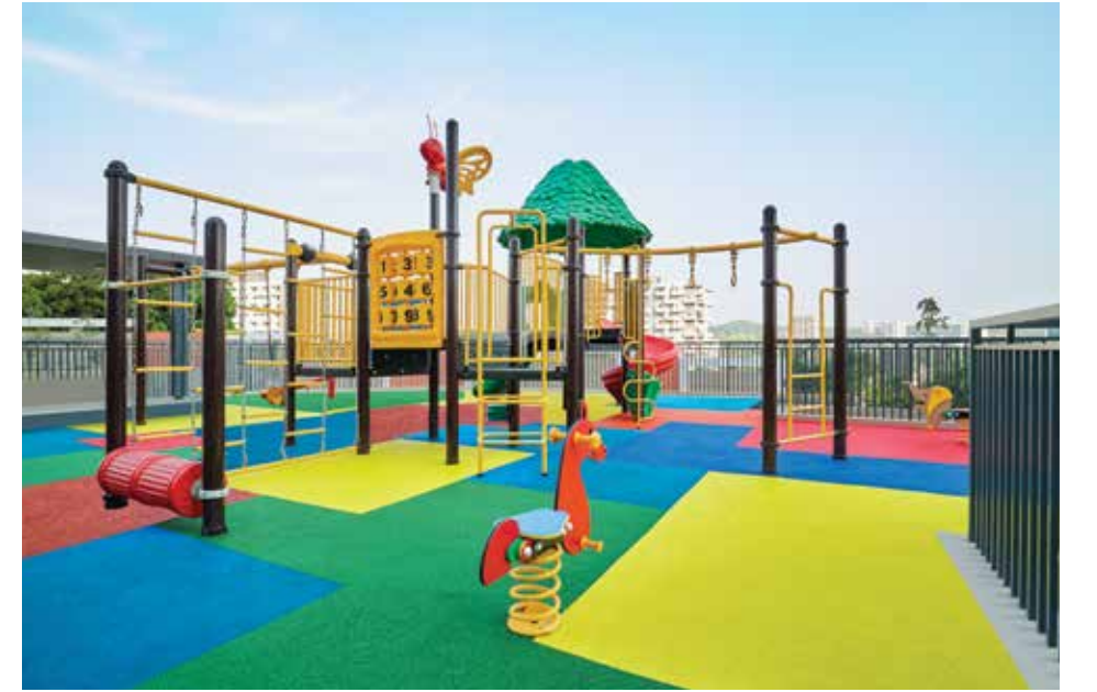
Safe and energy-packed Children's Play Area.